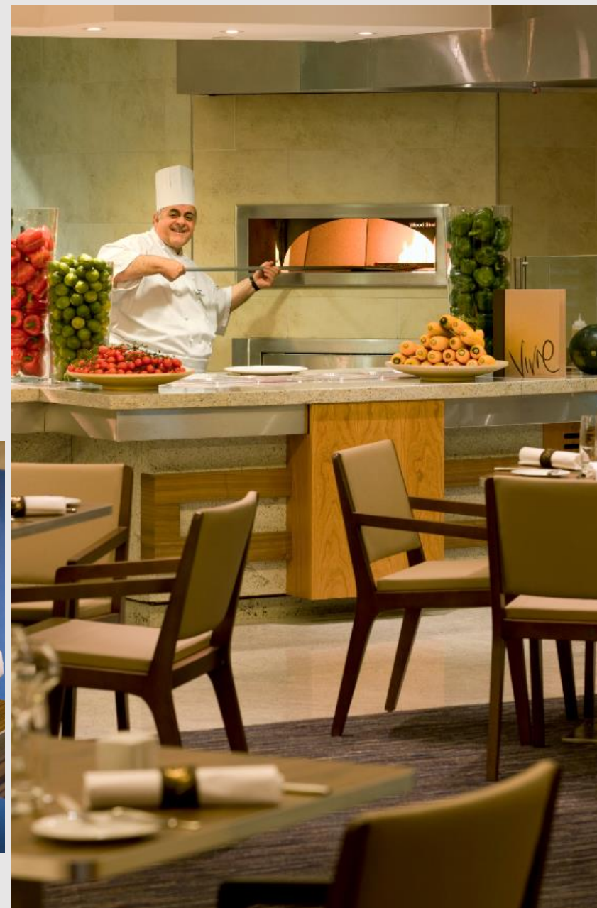
Vivre – 1 AA Rosette. Open kitchen fresh live cooking- seats 300