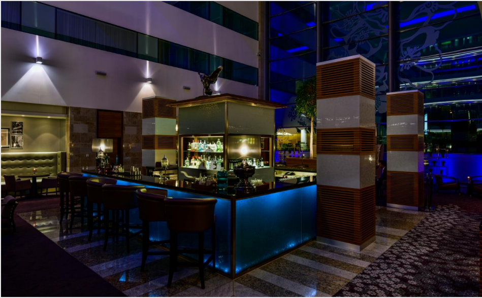
Le Bar Parisien – Champagne and fine wines