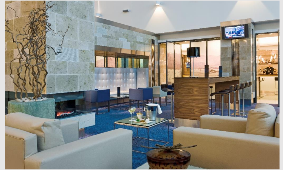
Sphere Bar – Cocktail bar & lounge