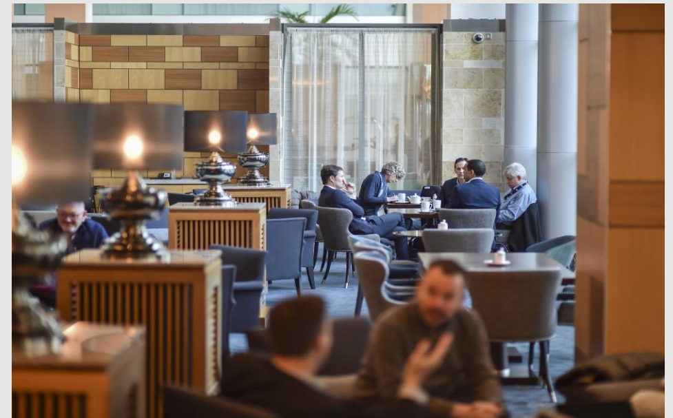
Tea 5 – Speciality tea lounge & cafe