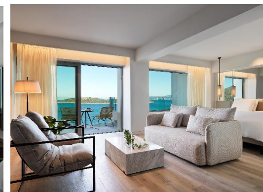
1. Deluxe Retreat Sea View — 2. Deluxe Retreat Plunge Pool Atrium View — 3. Deluxe Superior Front Sea View — 4. Deluxe Stunning Sea View Plunge Pool — 5. Junior Suite Front Sea View Plunge Pool — 6. Suite Stunning Sea View Plunge Pool