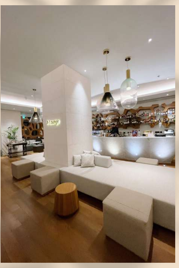
A Lounge A meeting point for unique wanderers