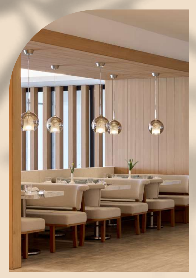
Ruen Romsai Our breakfast restaurant