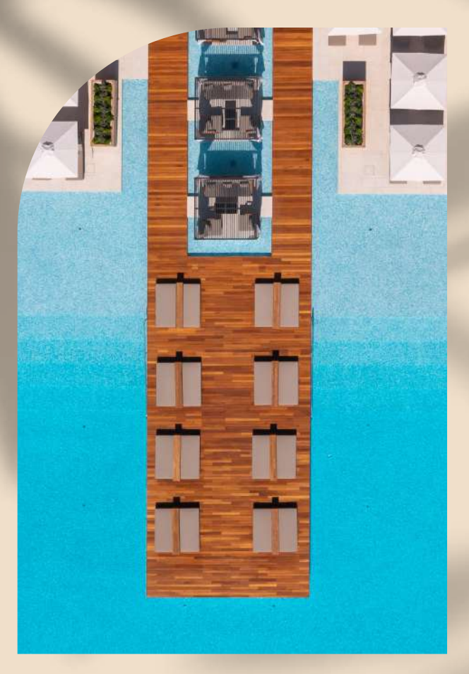
Sunrise Pool Bar Poolside lunch and drinks