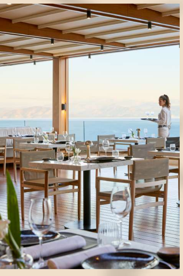
Koh Modern Asian fusion cuisine