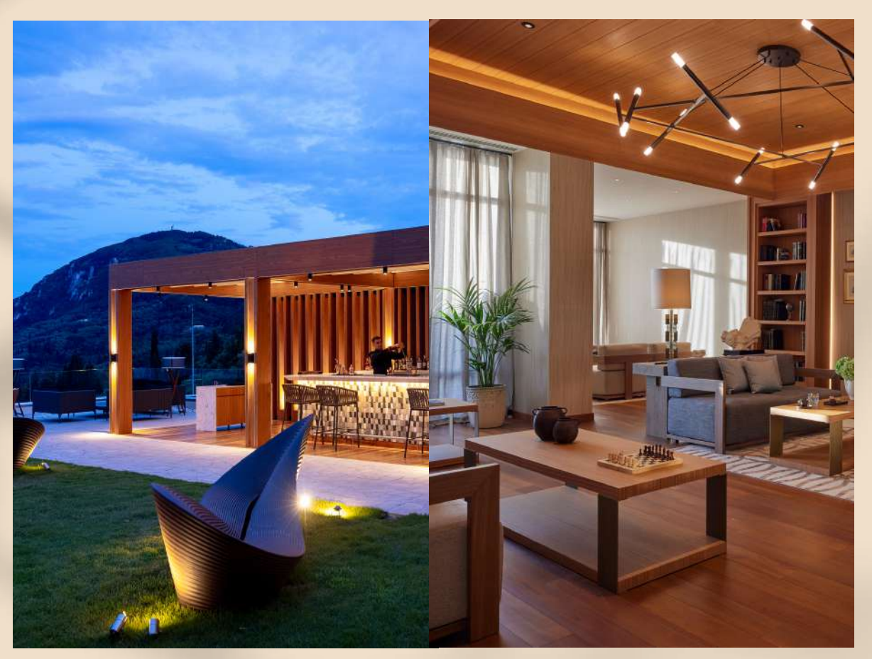
Starboard Lounge Relaxing Ionian afternoons