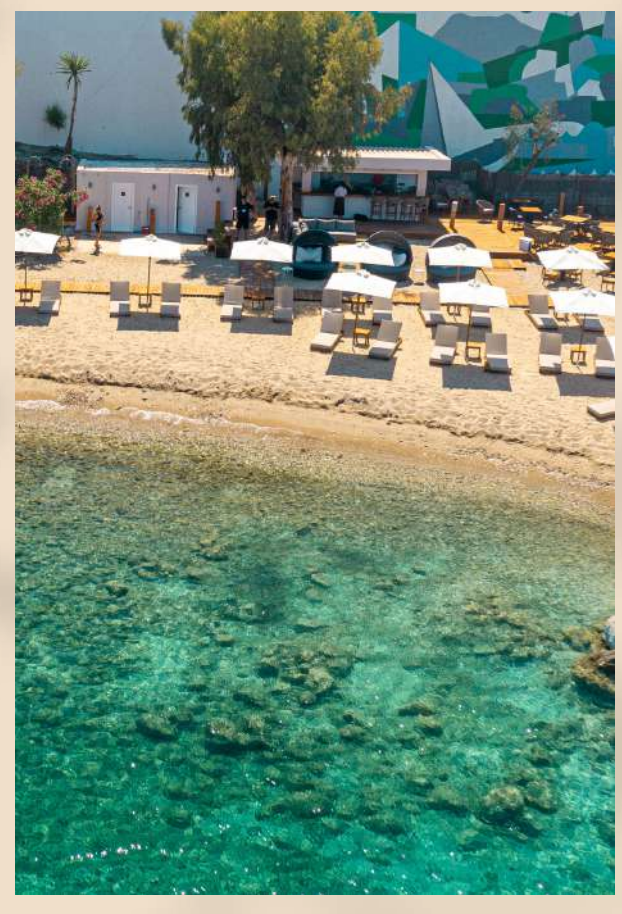
Emerald Beach Var & Restaurant All day drinks & snacks