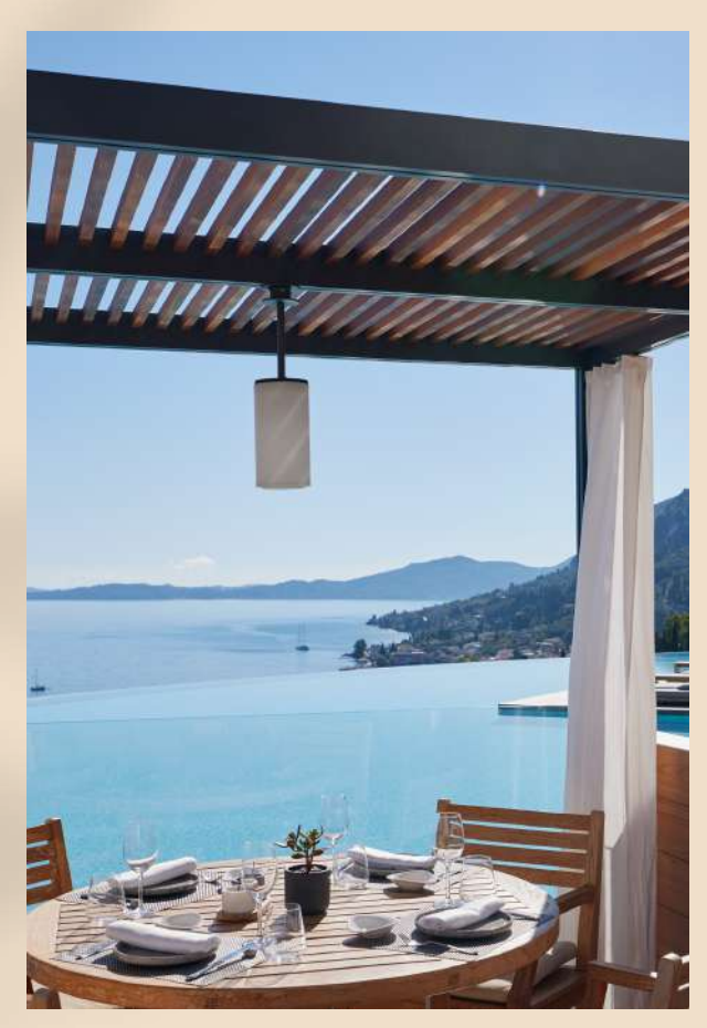
Sofrito A contemporary Greek tavern