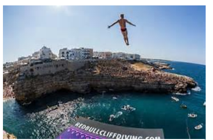
Cliff diving World Series