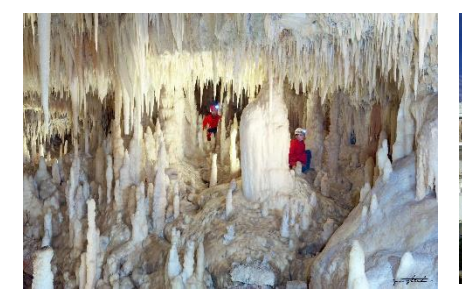
Caves of Castellana