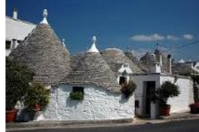
Alberobello UNESCO heritage sites