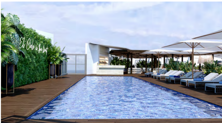
ElCielo rooftop pool bar and restaurant

DISCOVER THIS NEW STUNNING ADDRESS BLENDING THE FRENCH JOIE DE VIVRE AND THE SPANISH SPIRIT IN THE THROBBING HEART OF BARCELONA