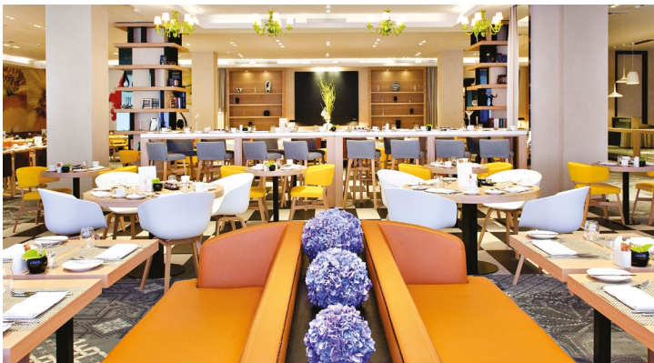
Kitchen Gallery Restaurant

SITUATED IN THE VERY HEART OF WARSAW, SOFITEL WARSAW VICTORIA DELIGHTS WITH POLISH HOSPITALITY AND THE FRENCH WAY OF LIFE - ART DE VIVRE.