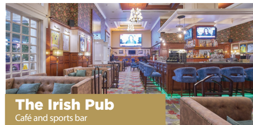
The Irish Pub Café and sports bar

Worldwide famous cigars, mature liqueurs, and refreshing beverages, as well as the widest range of premium tea and coffee. It seats up to 70 persons. Roofed terrace, a hookah, a smoking area and live music.