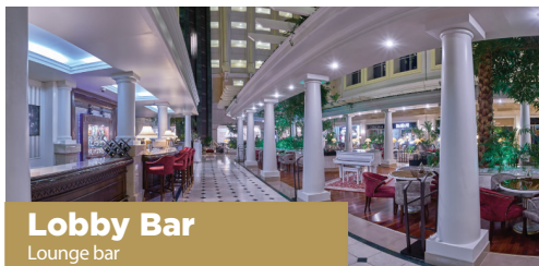
Lobby Bar Lounge bar

Lobby Bar offers a rich variety of sorts of tea, coffee, elite alcohol, snacks, deserts, and home-made cakes. It sits up to 100 persons, has an atrium with a high ceiling, a confectionary and Asian areas, an international menu, and live music