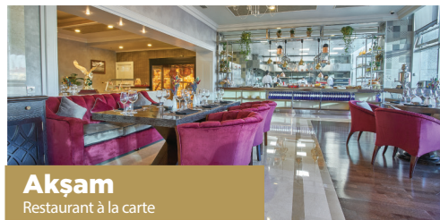
Akşam Restaurant à la carte

Exotic culinary delights from the Middle East inspired by the Osman cuisine. Handicraft decoration and flawless service bring some extra authenticity to the exquisite atmosphere of the restaurant that can seat up to 60 persons. There are two VIP lounges.