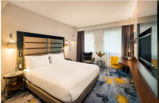
Superior Room City View

The windows of our city view rooms opens to the historical Beyoglu streets