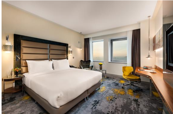
Superior Room Sea View

See the Bosphorus where Asian and Europe meets