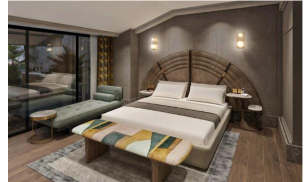
Suit Room City View

Our suites rooms having a wide private terrace make your feel the city