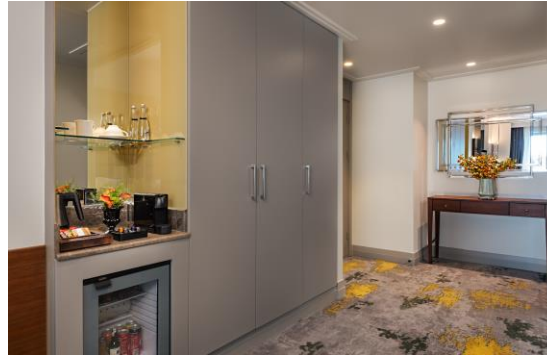
Deluxe Room City View

We deliactely prepare all details to make you feel like home