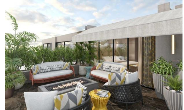
Suite Room Sea View

Have a deep fresh Bosphorus air from the private terrace of your suite